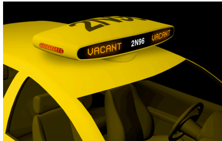
Transforming the vehicle: Image by Antenna Design New York for Designing the Taxi