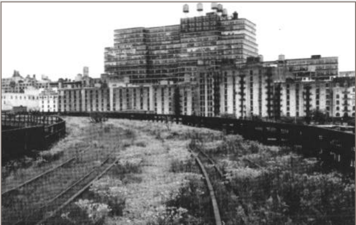
View south from 32nd Street

Joel Sternfeld© 2000 reproduction courtesy of Pace MacGill Gallery