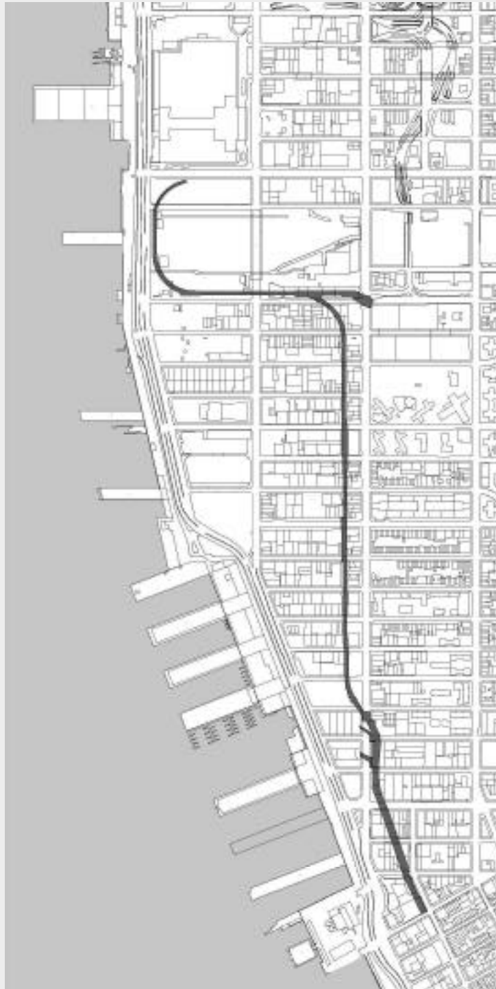
The High Line traversing Chelsea from West 34th Street to Gansevoort Street.