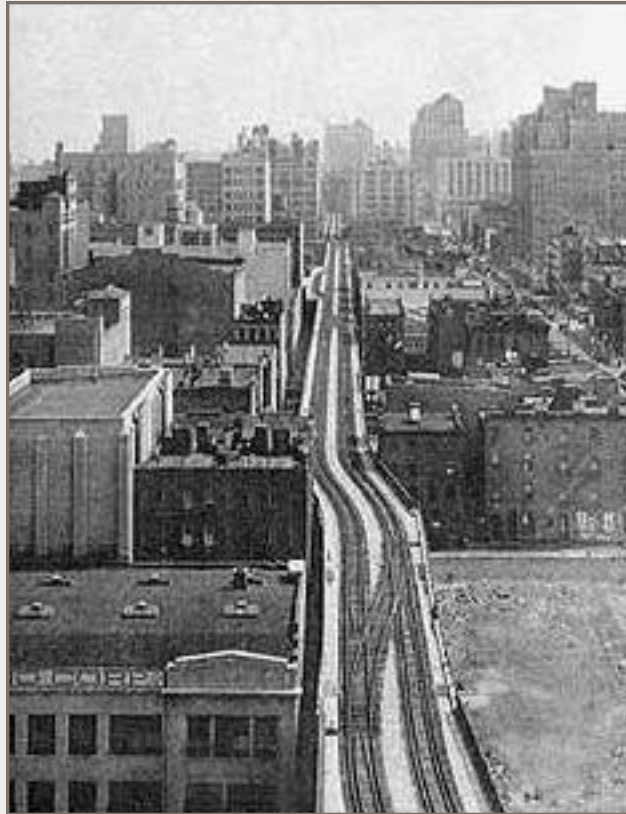
Looking north from 17th Street, ca. 1934.